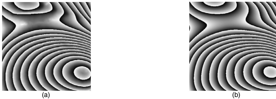
Fig. 3. (a) Gray level codification of a wrapped phase map recovered from a holographic interferogram. (b) Unwrapped phase map (shown wrapped for comparison purposes) obtained with the proposed method

Owing to the smoothness of these data, we could easily represent the unwrapped phase with few RBFs, in both experiments we used the parameters n = 7 \cdot 7 (49 RBFs) and \sigma = 1.8\delta_x . The results applying our technique are shown in Figures 3(b) and 4(b).