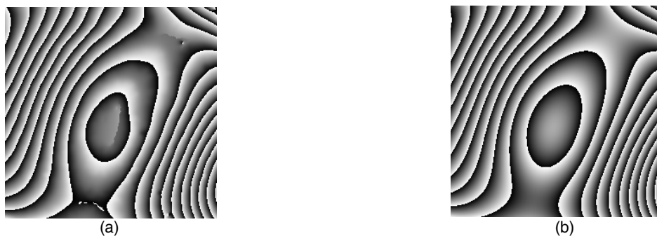
Fig. 4. (a) Gray level codification of a wrapped phase map recovered from an interferogram. (b) Unwrapped phase map (shown wrapped for comparison purposes) obtained with the proposed method